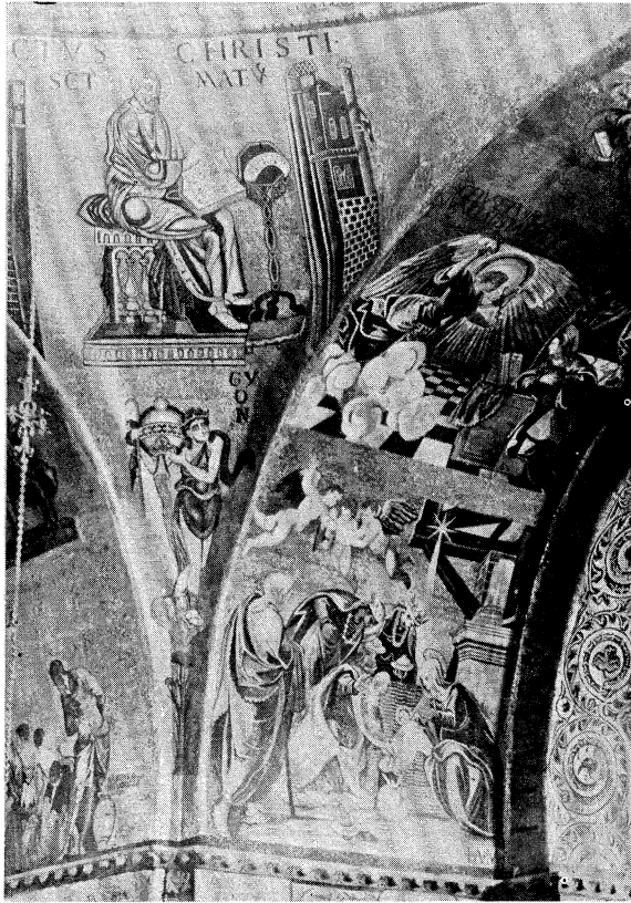
FIGURE 1. One of the four spandrels of St Mark's; seated evangelist above, personification of river below.

The design is so elaborate, harmonious and purposeful that we are tempted to view it as the starting point of any analysis, as the cause in some sense of the surrounding architecture. But this would invert the proper path of analysis. The