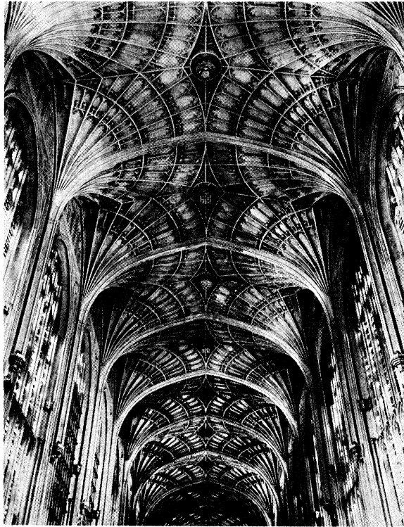
FIGURE 2. The ceiling of King's College Chapel.

the Tudor rose and portcullis. In a sense, this design represents an 'adaptation', but the architectural constraint is clearly primary. The spaces arise as a necessary by-product of fan vaulting; their appropriate use is a secondary effect. Anyone who tried to argue that the structure exists because the alternation of rose and portcullis makes so much sense in a Tudor chapel would be inviting the same ridicule that Voltaire heaped on Dr Pangloss: 'Things cannot be other than they